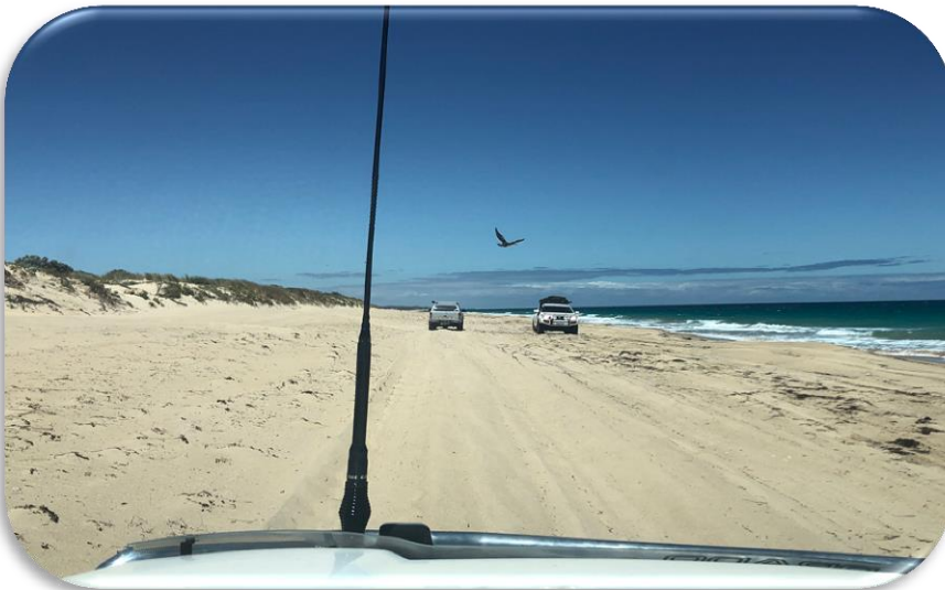
Above: Photobombed by a Whistling Kite